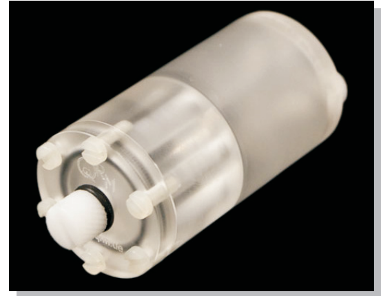
Micro-PET IQ Phantom (according to NEMA NU 4-2008)